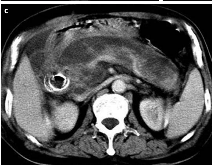
Figure 2. a–c. A 67-year-old male patient with acute pancreatitis at six days after stent placement. Upper gastrointestinal radiography, obtained with water-soluble non-ionic contrast medium before stent placement, showed obstruction at the level of the duodenal region (a). A duodenal stent was placed at the stricture area with partial expansion of the stent (b). CT demonstrated enlargement of the pancreas (acute pancreatitis) six days after the procedure, with the stent located in the duodenum (c).

13.0, SPSS Inc., Chicago, Illinois, USA). A P value \leq 0.05 was considered statistically significant.